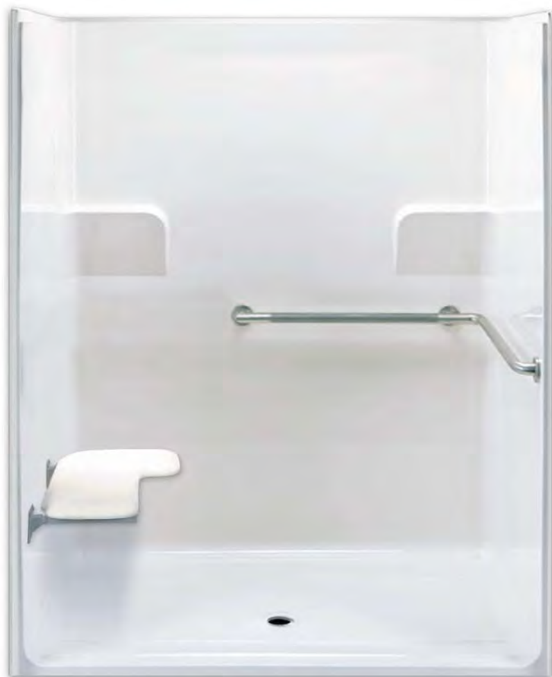
Shower shown with some available factory installed accessories Comes standard in white

Shower is ADA compliant when installed with available ADAAG accessories.